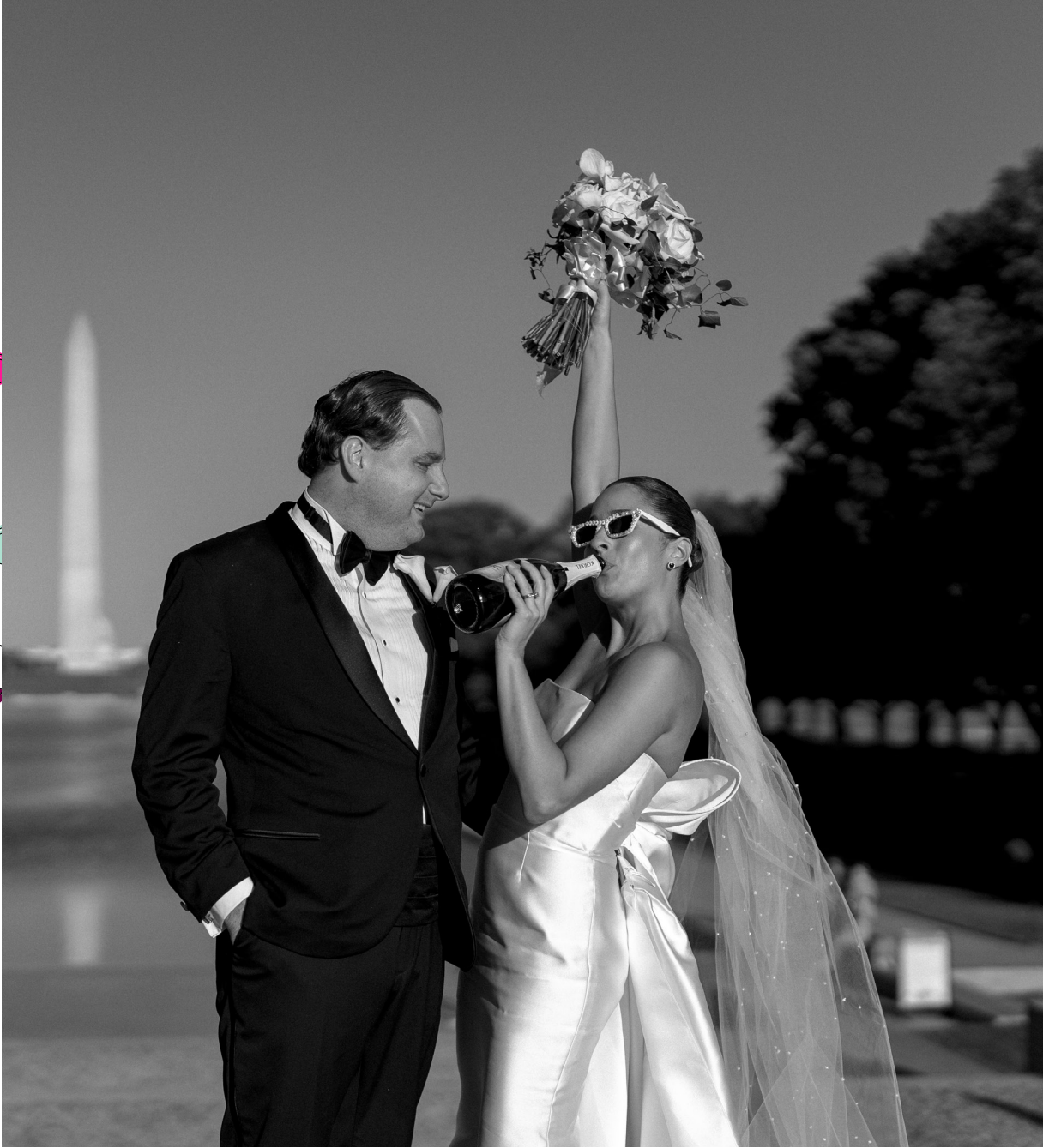
CLIENT: A FINE FETE EVENTS // PROJECT: BRAND STRATEGY AND WEB DESIGN & DEVELOPMENT